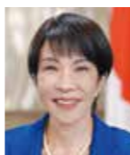
Prime Minister Sanae Takaichi

The core of the Takaichi Cabinet's growth strategy is "risk management investment." The public and private sectors will collaborate to proactively invest in resolving risks and issues, such as economic security, food security, energy and resource security, disaster prevention, and cybersecurity. These risks and issues are common worldwide, and if we can deploy products, services, and infrastructure that help resolve them globally, it will lead to further growth in the Japanese economy. Economic security is an investment, not an expense. I hope this ECONOSEC will serve as a significant opportunity for all participants to accelerate their efforts at public-private collaboration.